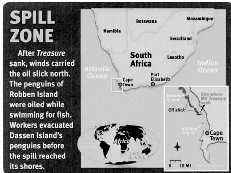
From Storyworks, April/May 2011 issue. Copyright © 2011 by Scholastic Inc. Used by permission of Scholastic Inc.