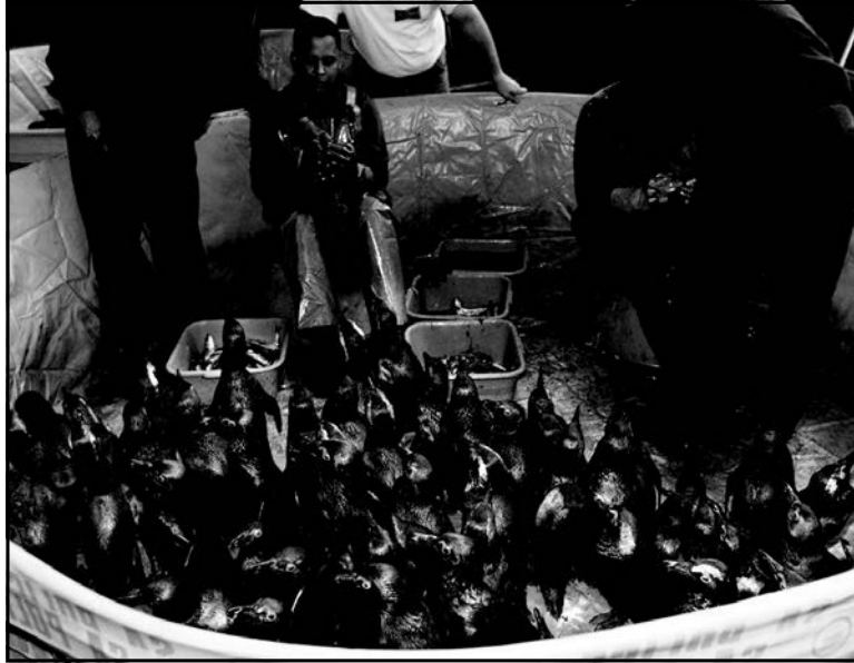
© AP Photo/Obed Zilwa. Used by permission.

penguins' primary habitat. In a matter of days, thick, toxic liquid had covered about 20,000 penguins. Without swift help, the seabirds would have no chance for survival.