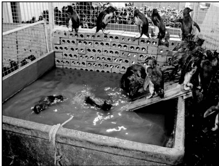
Tina Glass Tristan da Cunha Photo Portfolio www.tristandc.com