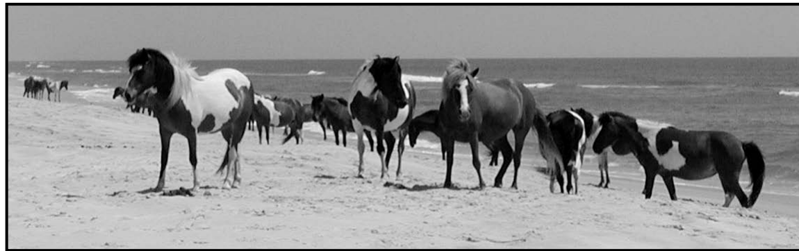
Text and photographs from “The Wild Horses of Assateague Island,” National Park Service, US Department of the Interior

from “The Wild Horses of Assateague Island”