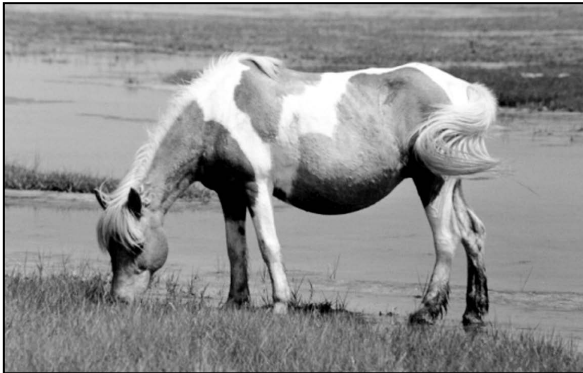
Text and photographs from "The Wild Horses of Assateague Island," National Park Service, US Department of the Interior