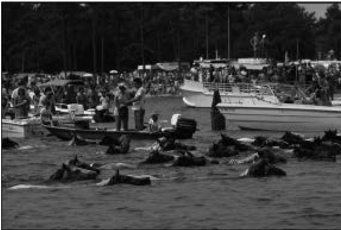
Photograph of onlookers watching ponies swimming during roundup (Image # 80995627), copyright © by James L. Amos/National Geographic/Getty Images. Used by permission.