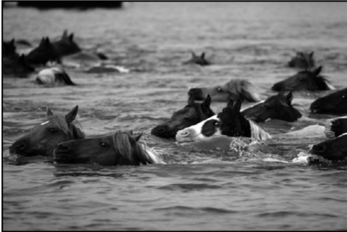
Photograph of wild Chincoteague ponies swimming the Assateague Channel (# ngs12_0248), copyright © by Medford Taylor/National Geographic/Getty Images. Used by permission.