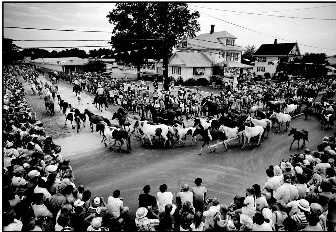
Photograph of ponies walking through town (NGS Image No. 719970), copyright © by Medford Taylor/ National Geographic Stock. Used by permission.